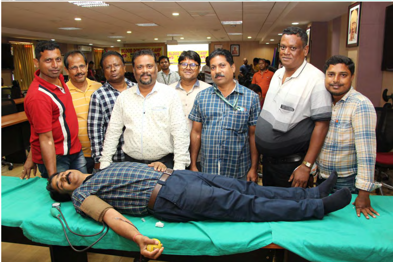
BLOOD DONATION CAMP AT ICAR-NRRI, CUTTACK ON 14 TH JUNE 2022