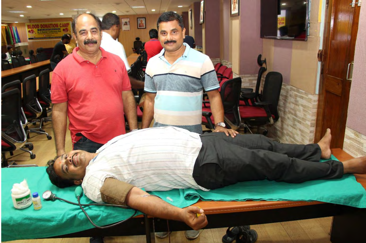
BLOOD DONATION CAMP AT ICAR-NRRI, CUTTACK ON 14 TH JUNE 2022