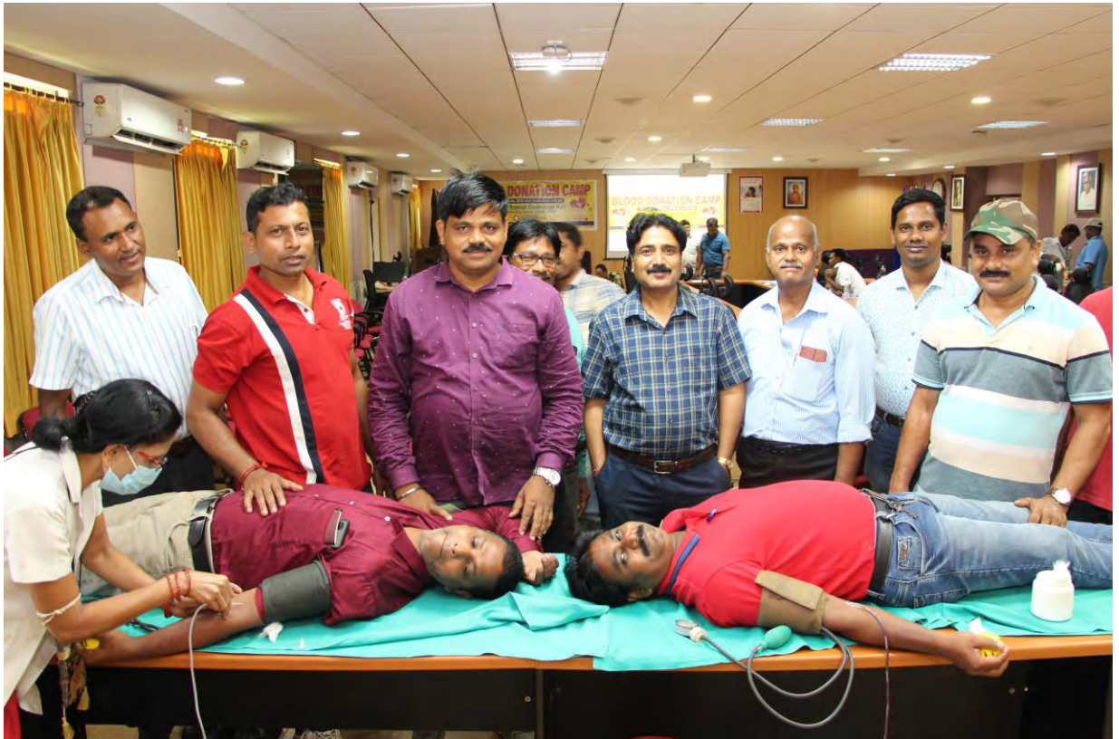
BLOOD DONATION CAMP AT ICAR-NRRI, CUTTACK ON 14 TH JUNE 2022