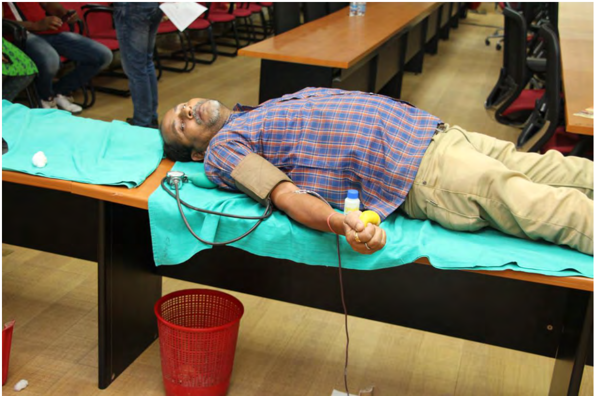
BLOOD DONATION CAMP AT ICAR-NRRI, CUTTACK ON 14 TH JUNE 2022