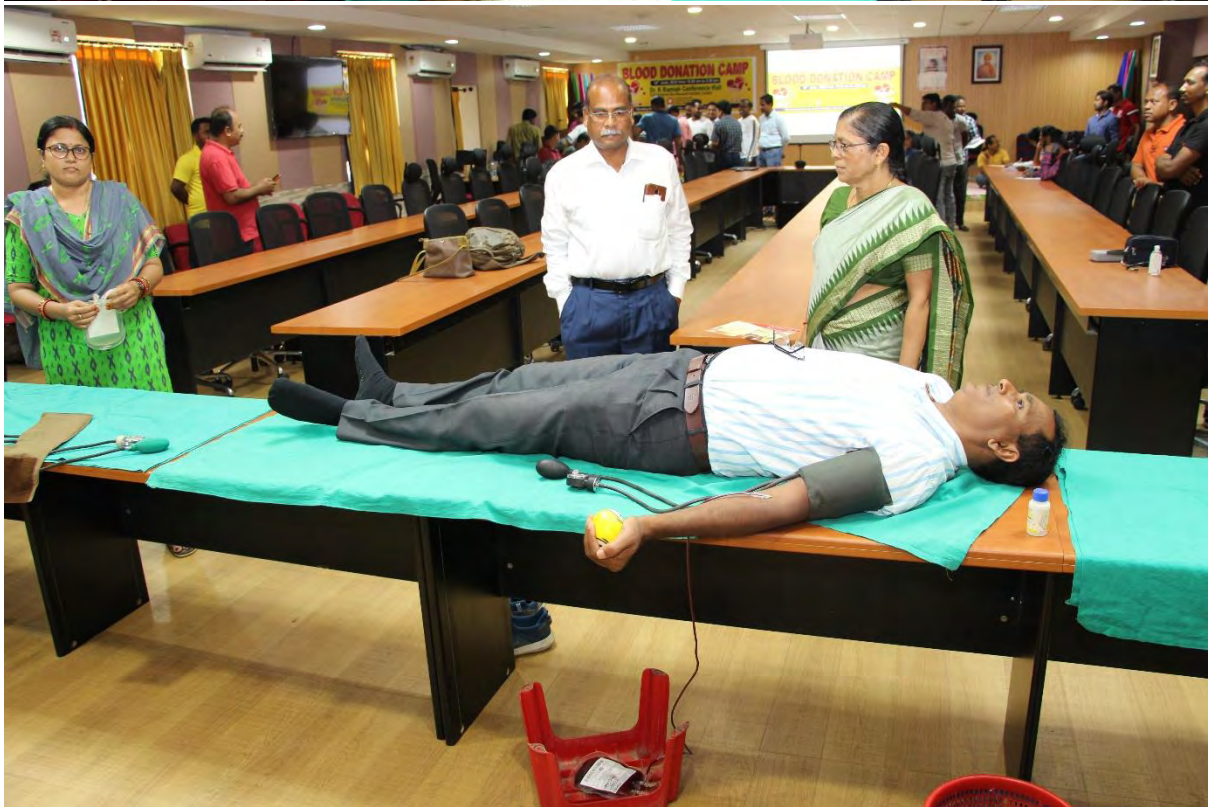
BLOOD DONATION CAMP AT ICAR-NRRI, CUTTACK ON 14 TH JUNE 2022