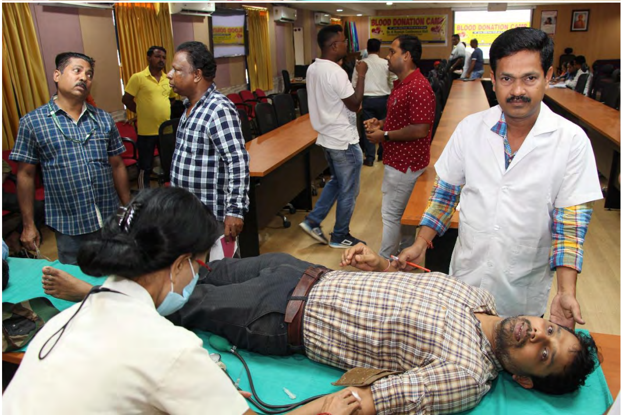
BLOOD DONATION CAMP AT ICAR-NRRI, CUTTACK ON 14 TH JUNE 2022