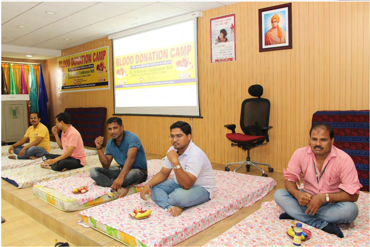
BLOOD DONATION CAMP AT ICAR-NRRI, CUTTACK ON 14 TH JUNE 2022