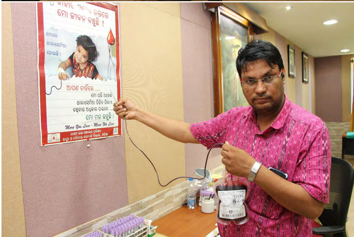
BLOOD DONATION CAMP AT ICAR-NRRI, CUTTACK ON 14 TH JUNE 2022