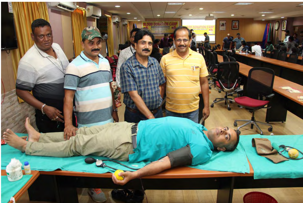
BLOOD DONATION CAMP AT ICAR-NRRI, CUTTACK ON 14 TH JUNE 2022