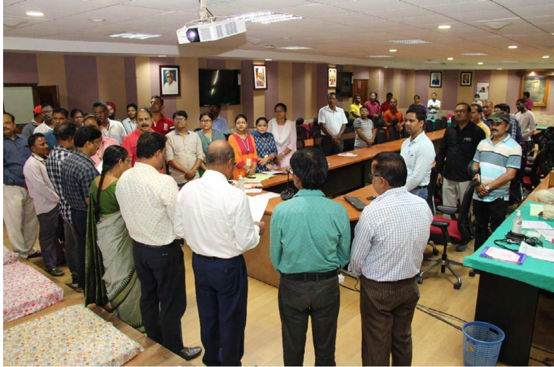
BLOOD DONATION CAMP AT ICAR-NRRI, CUTTACK ON 14 TH JUNE 2022