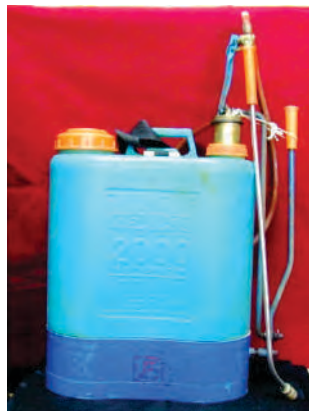
Knapsack sprayer fitted with flat fan nozzle

The most ideal machine for herbicide spray is lever operated knapsack sprayer with flood jet or flat fan nozzle. The nozzle helps to control the rate, consistency and thoroughness of herbicide application and the nozzle tip guides the spray pattern. The machine should be maintained well particularly during the wet-humid season. It should be washed properly after each day's work and dry in open sun; even if the same chemical is being used in the next day. The machine should be lubricated thoroughly and regularly for better efficiency. The nozzle should be checked before spraying, and if required, it should be cleaned properly. The spray machine and accessories should be checked before spraying. The machine should be calibrated by setting the spraying speed and nozzle swath by adjusting the spray height and nozzle spacing.