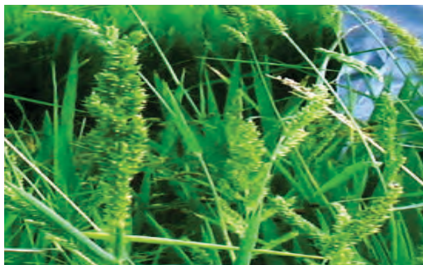
Echinochloa colona , the most dominant weed flora in rice field

Alligator weed ( Alternanthera philoxeroides ), Tropical spiderwort ( Commelina benghalensis ), Black pig weed ( Trianthema portulacastrum ) etc. and aquatic weeds viz., Fourleaf clover ( Marsilea quadrifolia ), Oval-leaved pond weed ( Monochoria vaginalis ), Water lettuce ( Pistia stratiotes ), Stonewort ( Chara zeylanica ), Water Spinach ( Ipomoea aquatica ), Giant duck weed ( Spirodela polyrbiza ), Duck lettuce ( Otella alismoides ), Arrow head ( Sagittaria sagittifolia ), etc.