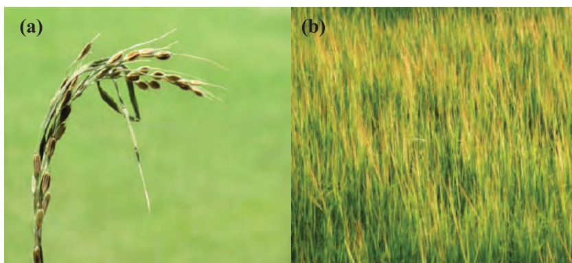
(a) Panicle of weedy rice with awned seeds and (b) rice field infested with weedy rice

Weedy rice, an introgressed form of wild and cultivated rice, seems to have inherited the high reproductive capacity from modern rice varieties, and seed shattering and dormancy from wild rice, which contribute towards build up and persistence of its seed bank in the soil. Its infestation is prevalent in the areas where direct seeding has been practiced in rainfed lowlands since a long time of eastern Uttar Pradesh, Bihar, Odisha, West Bengal, Assam, Manipur, and other hilly tracts of the northeast. But, the threat recently spreads in many other States in irrigated rice, particularly where direct seeding is being adopted by farmers on a large scale in view of the current challenges of hike in cultivation cost along with labour and water shortages.