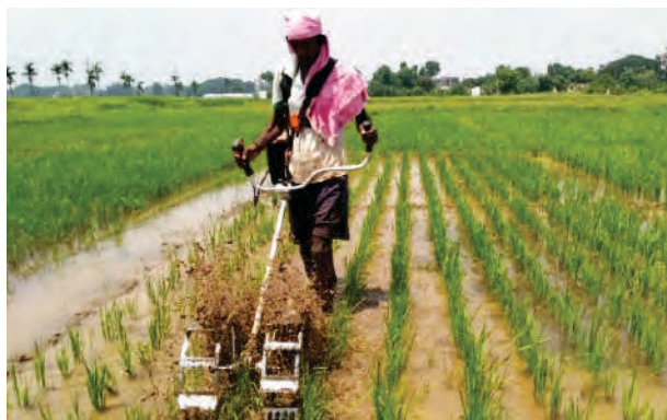
Mechanical weed control by power weeder