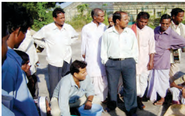
Scientist demonstrating the use of brine solution for seed cleaning